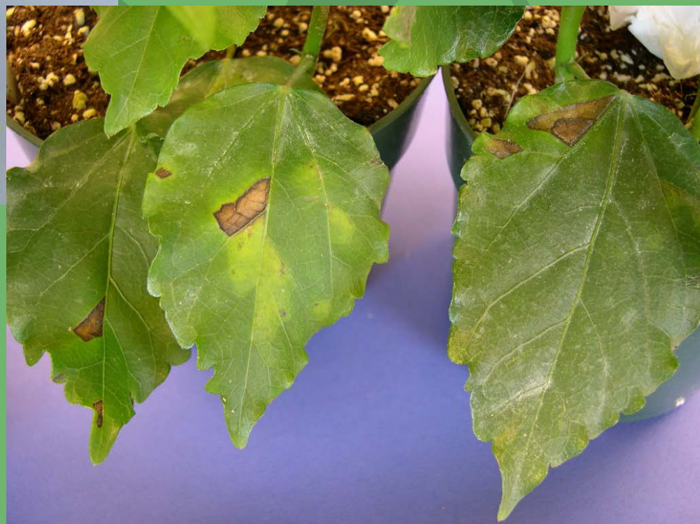
Chinese hibiscus with foliar nematode damage ( Aphelenchoides ).