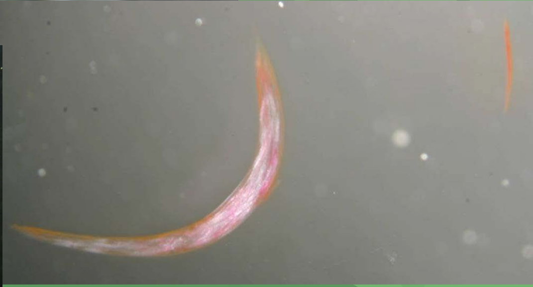
Heterorhabditis bacteriophora compared to a much larger saprophytic nematode.